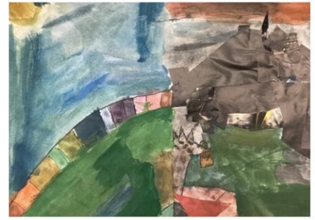
Scarlett Year 5

It is your responsibility to keep your contact details up to date with the school office. Please note you can opt in or out of photo permissions at any time by contacting the school office or through Studybugs.